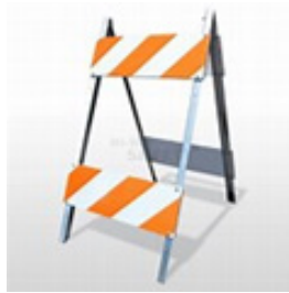
Type 2 (High Speed Roads)