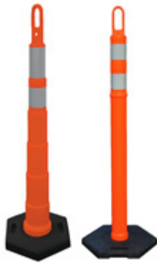
42" Traffic Looper Cone

Construction signs should be posted and documented. Orange Road Closed signs should be used by contractors only.