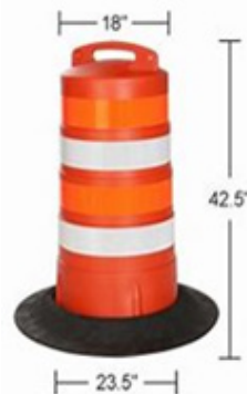
Traffic Barrel Drum