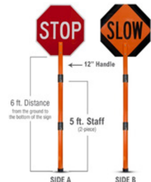
Stop/Slow Flagger Paddle

Always reference MUTCD or consult County Engineer for proper traffic control applications.