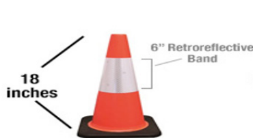
For day and lower speed roads ( \leq 40\text{mph} )