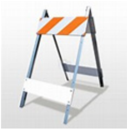
Type 1 (Low speed Roads)