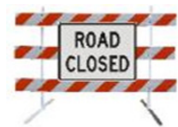
Type 3 (High Speed Roads/Closing Road)